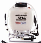
BACKPACK MODEL (15 LITER)