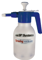
HAND HELD MODEL (1.5 LITER)