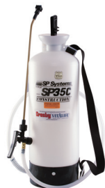
UPRIGHT MODEL (13.2 LITER)